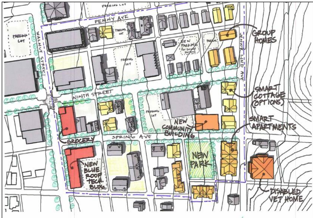
Figure 1. McKIZ Aware Community site plan.