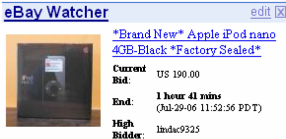
Figure 1: The Watcher for eBay scenario involves using retrieved data from eBay to generate an HTML table that is injected into an iGoogle portlet.