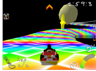
Figure 1: Image from Super Tux Kart’s Star Track.

Super Tux Kart open source 3D racing game (Figure 1) and 2) the Mario Bros. game (Figure 3).