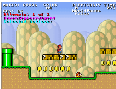
Figure 3: Captured image from Mario Bros.

MARIO BROS. For Mario Bros., we used the open source simulator from the recent Mario Bros. AI competition (Togelius 2009). In this game, Mario must move across a level without falling into gaps and being hit by enemies. Levels are randomly generated and vary in difficulty (more difficult gaps and types of enemies). Our goal is to train the computer to play this game by providing features extracted from screen captured images and corresponding actions taken by a near-optimal planner having full access to the game’s internal state. Here the actions are represented by 4 binary variables, corresponding to whether the Left, Right, Jump and Speed buttons are pressed. The player can choose any combination of these buttons at any step. Again here, since planning from the image features is non-