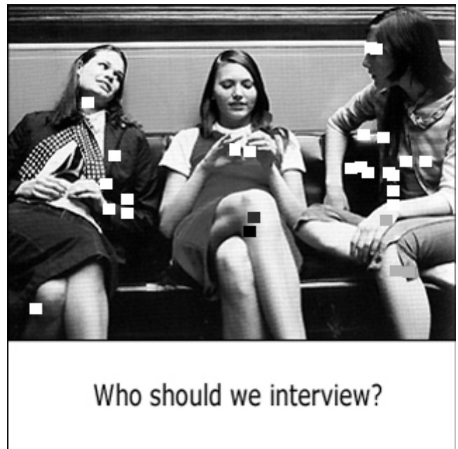
Figure 3: Election Image with 27 votels from the field test.

What constitutes a “goal” that users are voting on? For typical navigation questions such as “Where should we go next?”, or “Who should we speak with next?” the goals are meaningful regions or segments of the image. We propose to use clustering algorithms [22] to identify groups of neighboring votels. After votels are classified into groups,