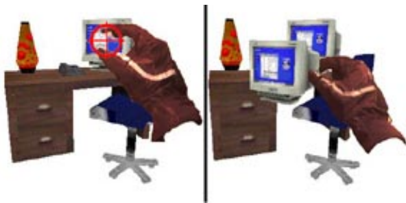
Figure 2: Creating A doll

The user creates a doll using an image plane technique [15]: he positions his hand so that the crosshair attached to that hand appears over an object in his line of sight and pinches together the index finger and thumb of that hand (see Figure 2). This selection is analogous to placing the mouse cursor over an object on a desktop display. Selecting an object creates a doll that is scaled to a convenient working size (we use half a meter along its longest dimension) and placed in the user's hand.