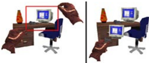
Figure 3: Framing the desired context: the phone and monitor are selected

Another possible rule is to consider semantic relationships, so that objects on a table would be added to the context, but a chair nearby would not. The current system implements semantic relationships through a parent-child hierarchy. When a doll is held in the left hand, the system recursively creates dolls for all the children of the reference object and adds them to the context.