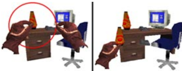
Figure 4: Specifying the radius for the context: the lamp and phone are selected

The user can also explicitly indicate what objects to include in the context. Using both hands the user can frame on the image plane (Figure 3) the objects to be included in the context; the user pinches the thumb and middle finger of his right hand together to start framing, and creates the context by pinching together the thumb and index finger of his left hand. The system adds any object that is completely visible in the frame to the context. Alternately, the user can explicitly specify a radius around a reference object (Figure 4): the system adds any object completely within that radius to the context.