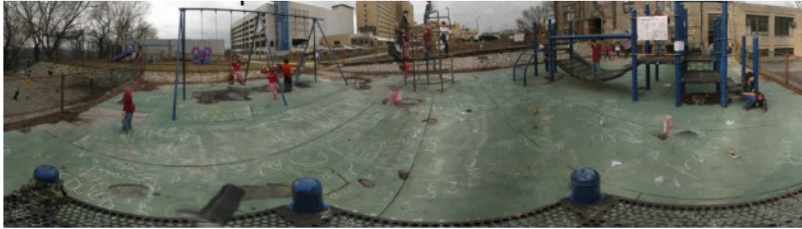
Graffiti on playground- all legible in panorama (Pittsburgh, USA)