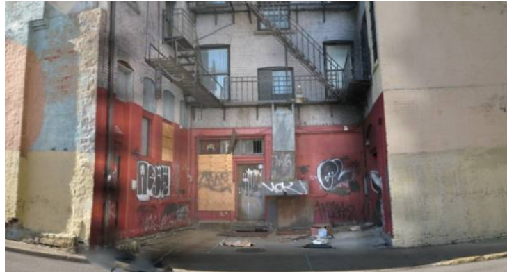
Typical urban graffiti and pollution (Pittsburgh, PA)

For each panorama the students took numerous snapshots, totaling 200. 4 Fifty five of the conversations consisted of the students exchanging with each other.