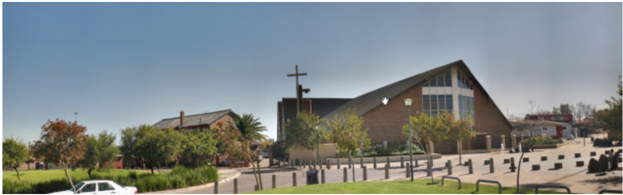
Regina Mundi church (Soweto, South Africa)