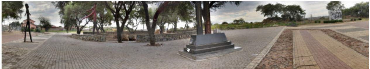
Tsietsi Mashinini Memorial (Soweto, South Africa)