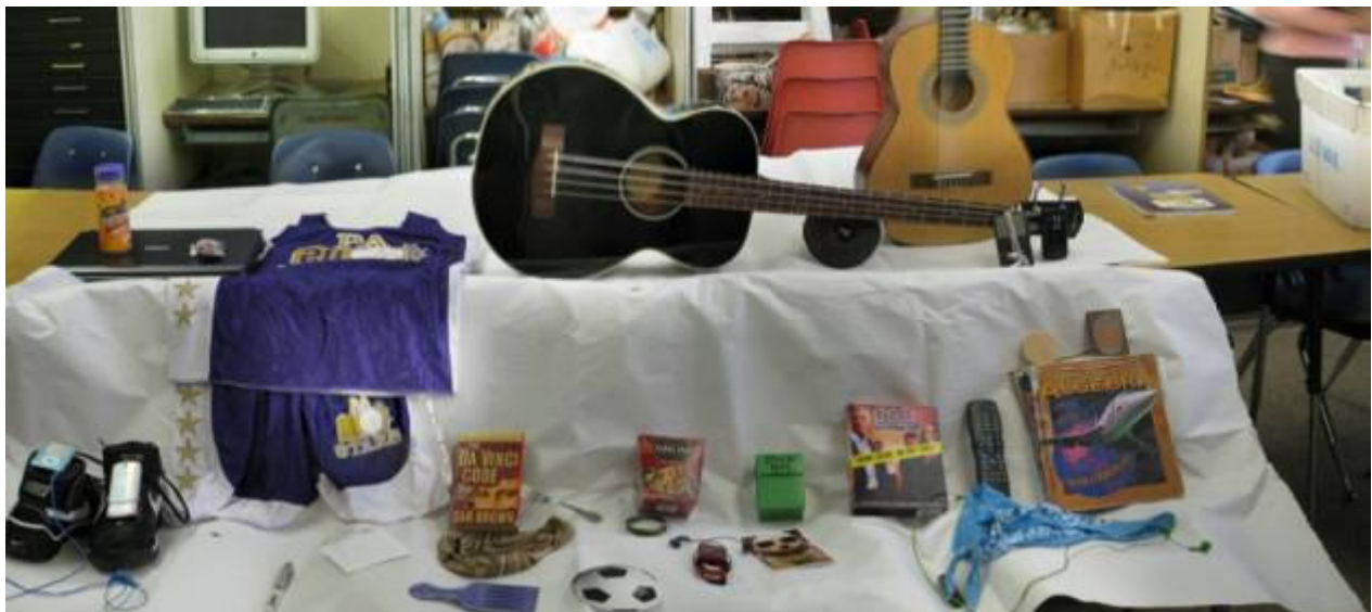
Valuable personal artifacts (Pittsburgh, USA)