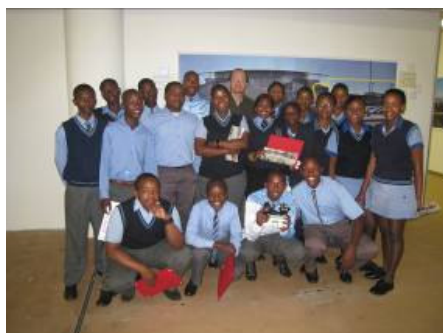
GigaPan Soweto/Lavela (South Africa) student portrait