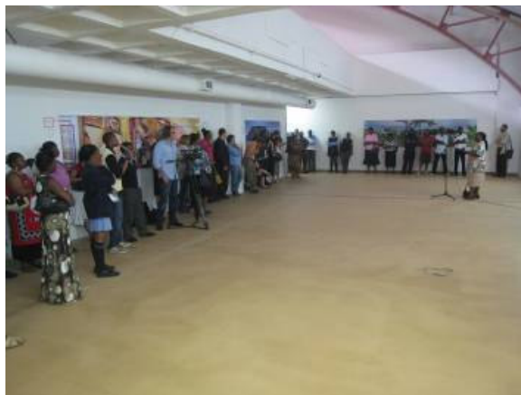
Soweto students, families and teachers at the Gallery Opening

The prestige of the project has been one of the reasons that developing the GigaPan project was successful. The prestige associated with the project can be attributed to several factors such as: the fact that UNESCO was supporting it; the professor and an inventor of the robot were there in person at Lavela; the national education commission had been contacted; and the arrival of members of the press and the planning of local art galleries on hosting exhibits of the students work seemed to entice the school management to state that the GigaPan project had their full support. The school officials were clearly aware that their school would be in the spotlight both professionally due to the interest of the South African Department of Education and visibly by being highlighted both by the press and having their students work on display in a prominent national gallery.