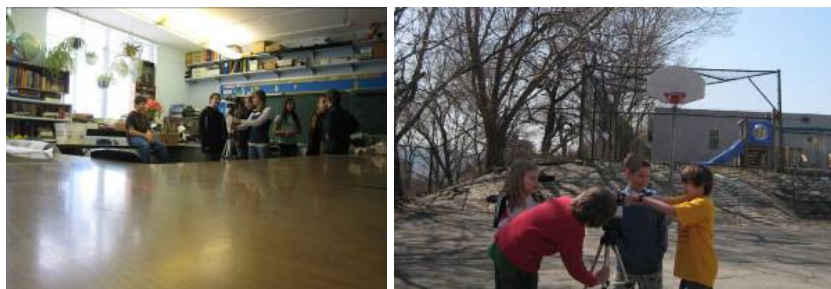
Falk School during in-school training and use

The Falk Laboratory School of the University of Pittsburgh has 275 students, serving grades K-8. The GigaPan Conversations project was initially integrated in the Technology curriculum,