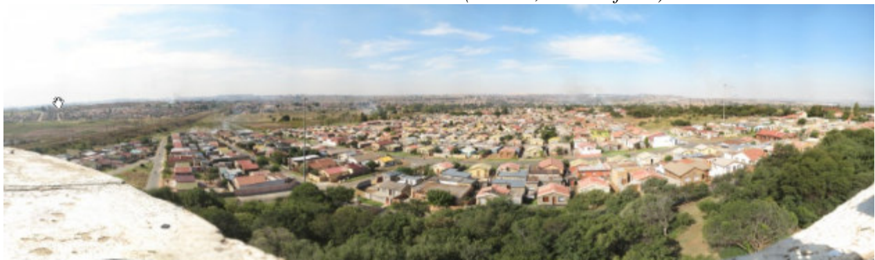
Soweto from tower (Soweto, South Africa)