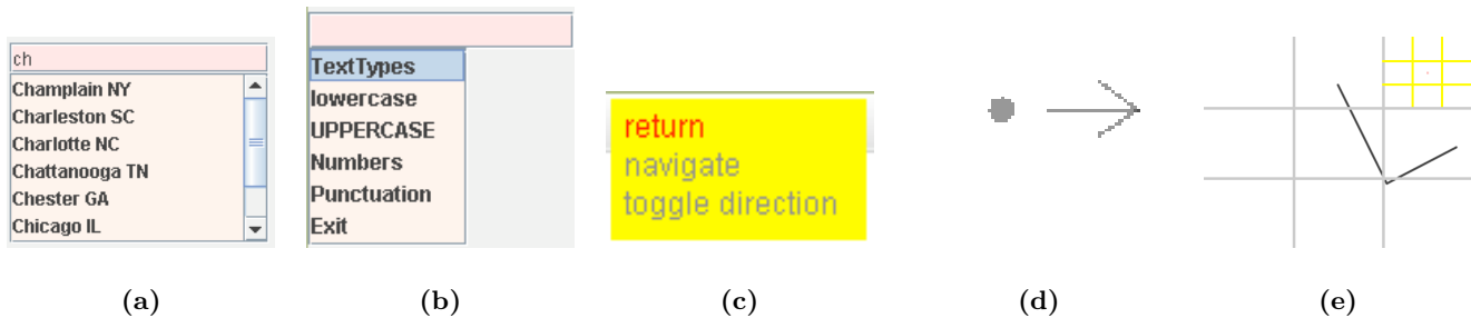
Figure 3: Example IAT adaptations. (a) For keyboard-only input IAT replaces a list with an interactor that prunes items based on entered text. (b) For switch input, IAT replaces a textfield with an interactor that allows the user to select specific characters one at a time. (c) For switch input, IAT uses a popup menu to allow the user to select between navigation or interaction. (d) For switch input, IAT augments canvases with a drawing dot and direction arrow that users can manipulate. (e) For speech input, IAT augments canvases with a grid-based selection tool (the black lines are on the canvas itself).

In the pointer case, no navigation adaptations are necessary. IAT does not augment navigation for pointers .