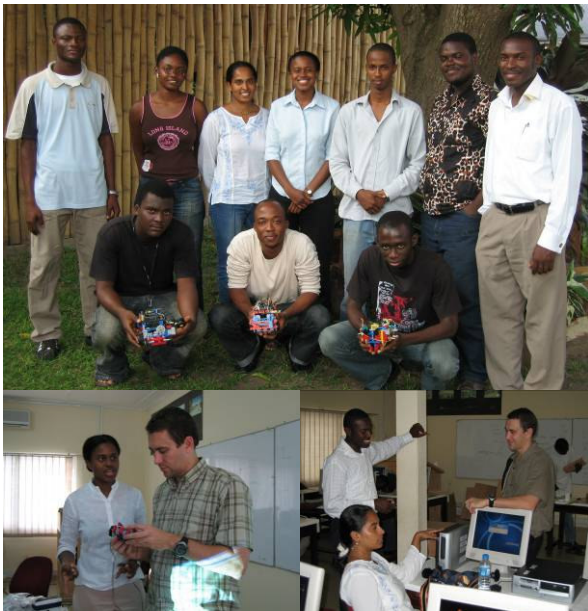
Figure 1 – Course participants and instructors

A number of factors motivated the decision to design and implement an introductory robotics and artificial intelligence course at Ashesi University. The first was an observed tendency of students to think of Computer Science in a very narrow way: for example, in terms of software engineering applied to web and database applications and business productivity tools. Our goal was to encourage students to recognize the breadth of Computer Science and their ability to harness its power to solve challenging problems in the context of a developing country. Through this process we hoped to enhance the technical creativity and problem solving abilities of the students while expanding their perception of computer science and exposing them to a wider knowledge base and range of skills that could be applied to the problems they would encounter in their professional endeavors. A hands-on course in Robotics and Artificial Intelligence was chosen as a platform to achieve our goals because of the multi-disciplinary nature of these topics and their ability to excite students and inspire them to be creative ([3],[15])[3].