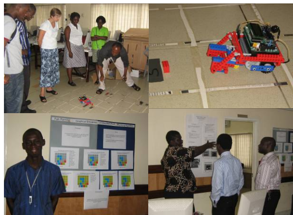
Figure 4 – Ashesi students presenting final projects

Technical Skills: The students found that the course challenged them greatly. They learned about the intricacies, frustrations and joys of working with hardware and software integration, the inevitability of noise and errors when dealing with real-world sensors and motors, and the importance of practical applications based on an appropriate theoretical foundation. They acquired important system development skills, with a focus on the iterative nature of design, development, and testing. In the words of one student, they learned to “test, test, test!”