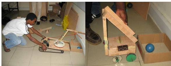
Figure 2 - Building machines from local materials

Students completed four tasks and three short quizzes in the first five weeks of the course, and a final project in the last four weeks of the course. The bulk of each task was a hands-on activity designed for teams of two or three students. The first task was to design and build a machine to deliver a small ball to a goal using locally available materials, and with a very small budget. Subsequent tasks required the students to build a Lego robot, program it to perform basic motion patterns, add onboard sensing to enable it to navigate a maze, and finally implement the wave front planning algorithm to enable the robot to navigate an environment with obstacles.