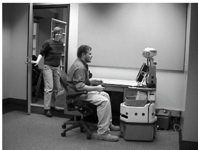
Figure 2. Robot and participant.

Twenty-one participants were randomly assigned to interact with either the serious ( n = 11 ) or the playful ( n = 10 ) robot. Participants averaged 25 years old. There were 9 females and 13 males. (We report only results from native English speakers because nonnative speakers frequently failed to understand the robot's simulated speech.)