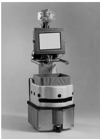
Fig. 1. Robot viewed in experiment.

In the current experiments, we asked participants to estimate the likelihood that a robot made in New York or Hong Kong would know and recognize landmarks in these cities. Half of the participants (HK condition) were told that the robot was built at a robotics institute at the Hong Kong University of Science & Technology and the other half of the participants (US condition) were told that the robot was created at a robotics institute in a university in the United States (Columbia University). Participants were shown pictures of these universities.